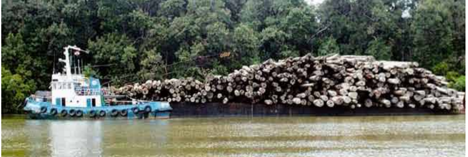
Large quantities of illegal timber are transported by river in Indonesia. (Agus Andrianto)